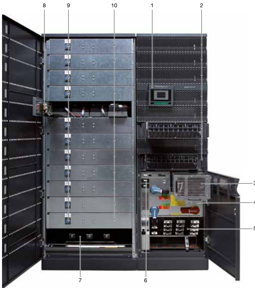
Modular battery cabinet