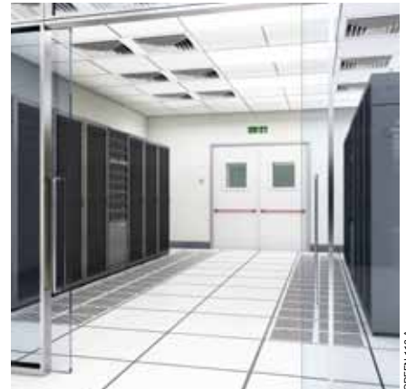
GREEN 113 A